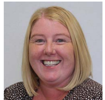
Early Years Practitioner